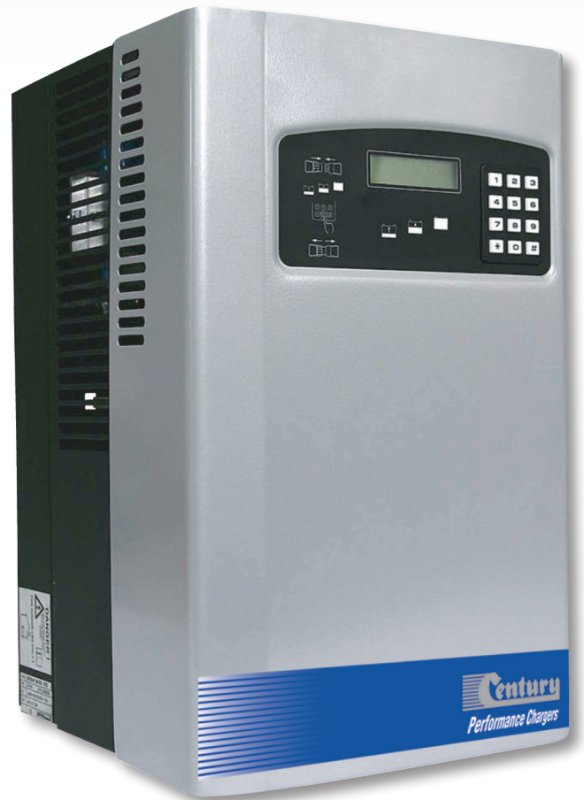
Product shown above: MTM-HF 48V 130A