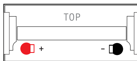
Terminal Type - M10